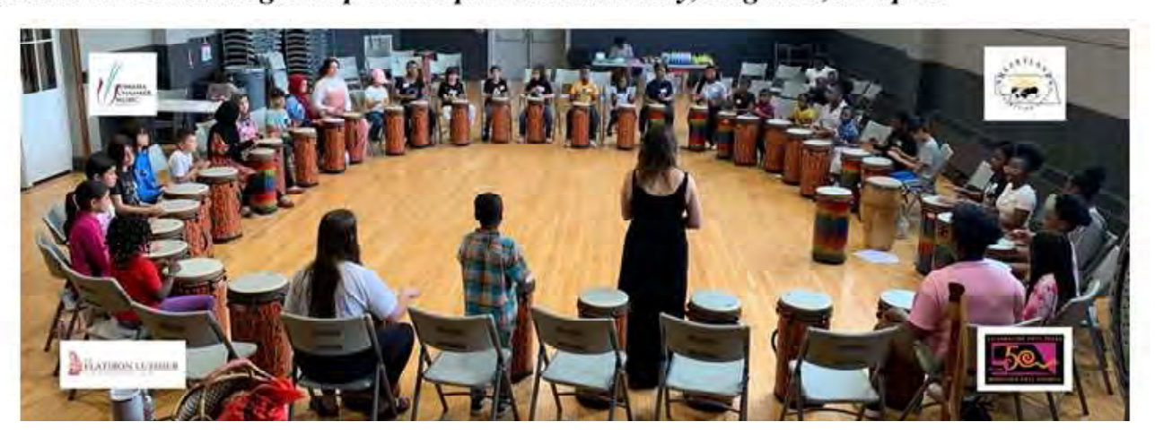
I hope to meet you soon at Yates Illuminates!

Also, what better way to end your Saturday than to join us for a FREE Public Performance by our Summer Drumming Camp Participants on Saturday, August 3, at 7 pm?