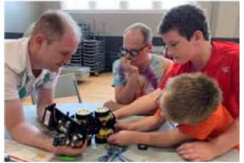
Funded in part by Omaha Community Foundation, Midtown Neighborhood Alliance, and donors to Yates Illuminates