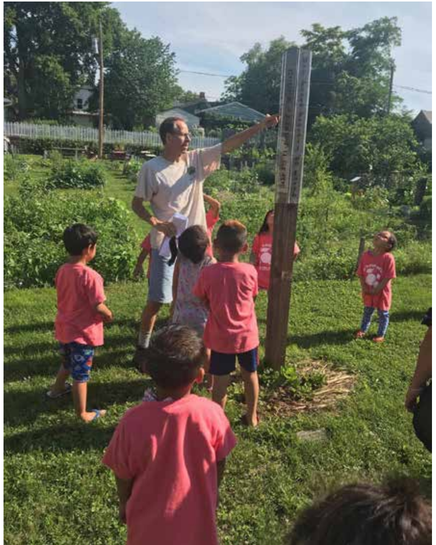
Yates Pre-K students learning about the peace pole while on a field trip at the community garden. The peace pole says "May Peace Prevail on Earth" in six different languages, representing the diversity of our neighborhood.

The Yates programming will start on Monday, August 20th.