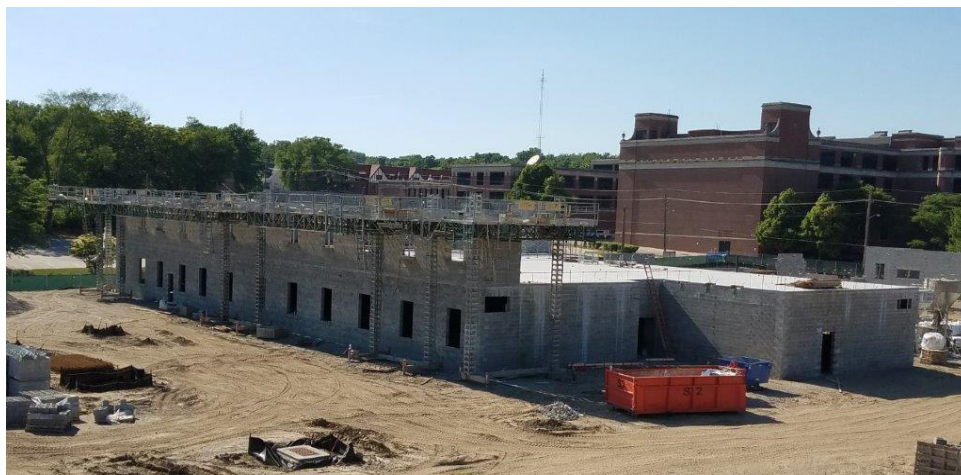
The walls are going up on the new elementary school currently being built at 32nd and Burt St. Photo taken from the southeast corner of construction area in early June.

When I was a youngster growing up in Gifford Park over a half-century ago, it was a tradition for people to display the American Flag on national holidays. It was a means of showing patriotism and appreciation for our country, though not necessarily for our government. Personally I still try (with some lapses) to do that. I noticed on Memorial Day that ours was one of the few houses in the neighborhood that “showed the flag”. I understand that the current administration is controversial (to say the least). But I am reminded of a quote from a book, uttered by a Russian: “I love my country, but I distrust my government”. I love my country as well. Hopefully you do to. And perhaps you will consider “showing the flag” on upcoming holidays, like Flag Day (June 14) and especially Independence Day, July 4th.