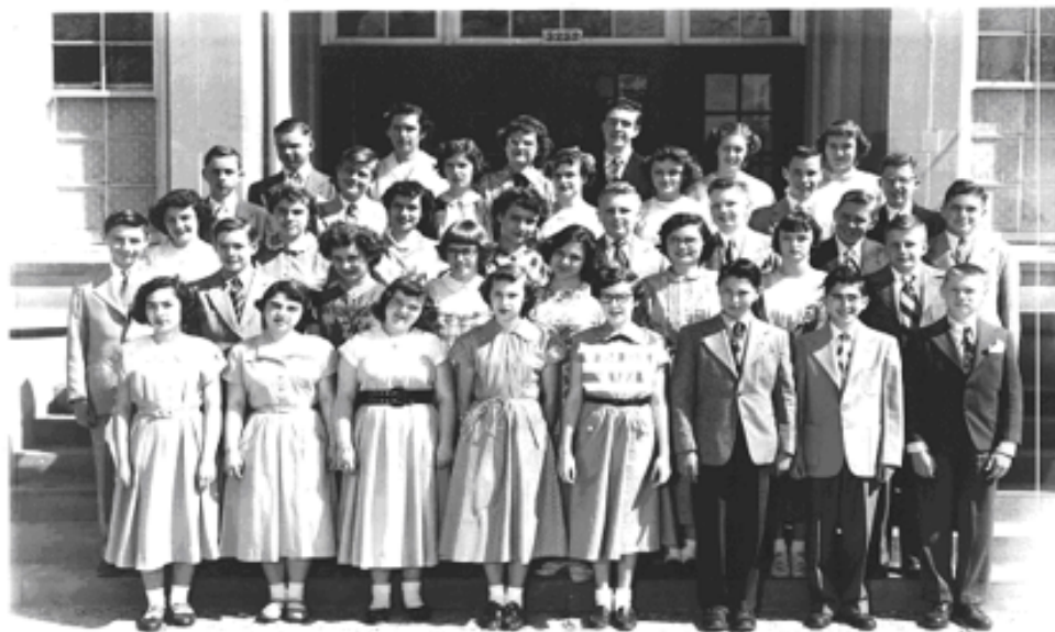
1950 Yates Elementary 8th Grade Class

trust and thus readies them for success beyond belief. Which will move mountains. Or hills. Even literally, we hope, come March 2017 in Gifford Park Neighborhood.