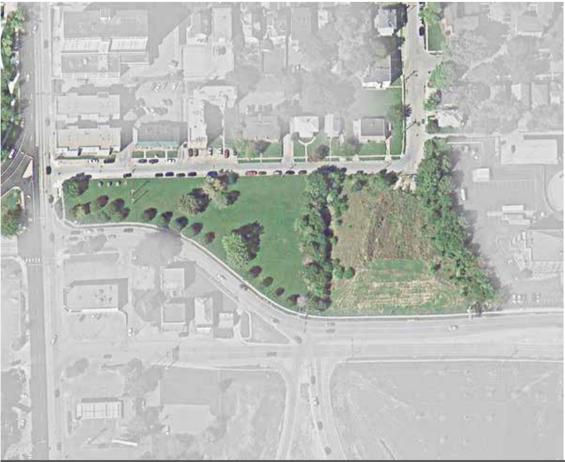
SITE PLAN TURNER PARK NORTH GREEN SPACE