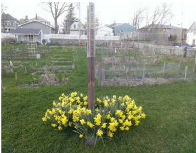
Community Garden peace pole celebrates our neighborhood's diversity by displaying "may peace prevail on earth" in six different languages.