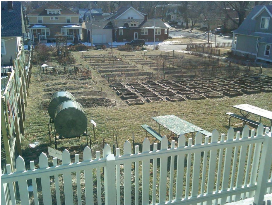
Gifford Park Community Garden in February 2012. Gardeners neighborhood-wide anxiously wait for the ground to thaw so they can get their hands dirty!