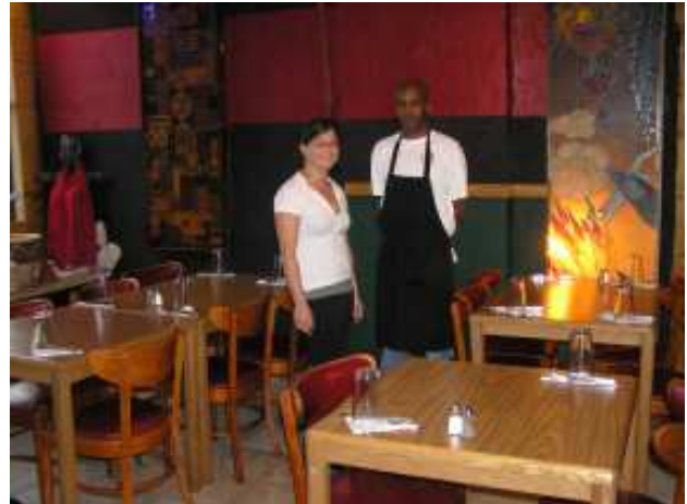
A New Restaurant