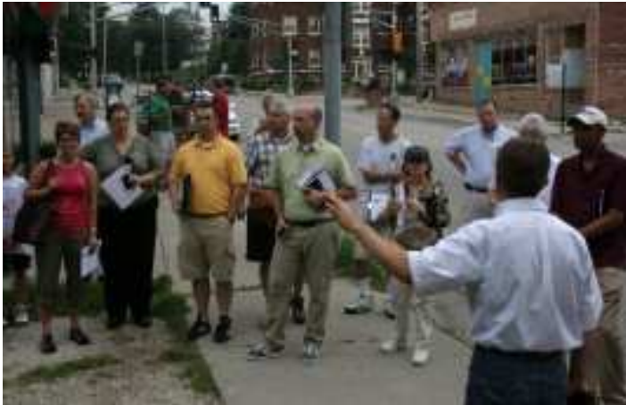
A Neighborhood Tour