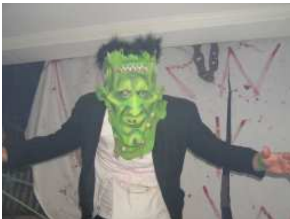
The ghouls were out in force at the GPNA-PKA Annual Haunted House this year. For a recap of the event, please see page 4.

Next General Meeting Thursday, November 12 7:00 P.M.