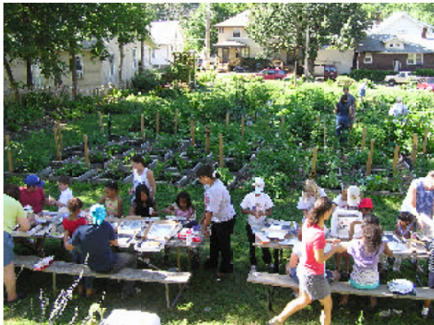
The Gifford Park Community Garden was buzzing with activity on July 22. Projects undertaken that day included making salsa, pickling vegetables, and baking "solar" veggie pizzas.