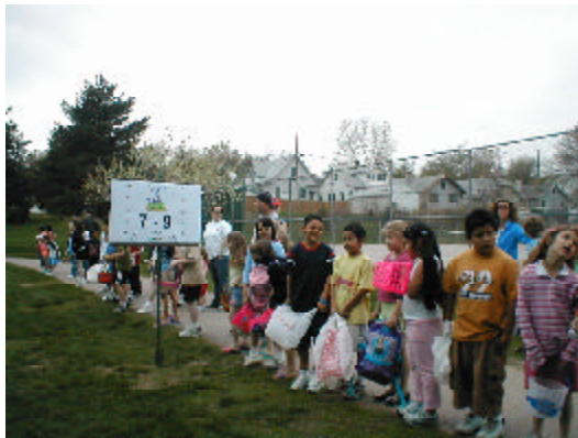
Easter egg hunt participants are shown anxiously awaiting the countdown that leads to the mad rush for candy