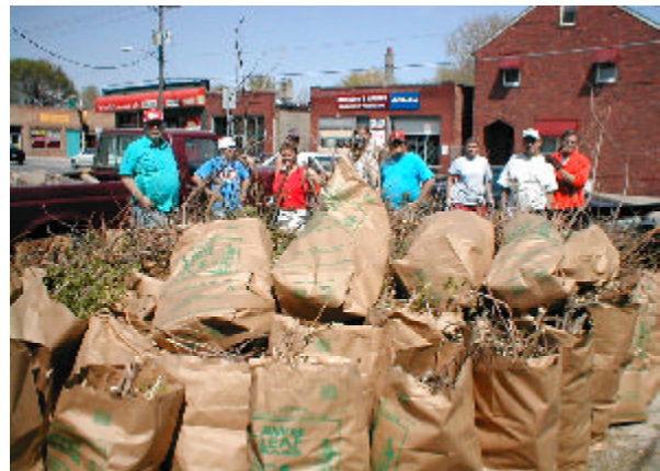
Volunteers look over the bags of leaves, branches, and other debris that was cleaned up in the business district on Earth Day. A horseshoe pit will be located behind the lot between J'N'J Grocery and the California Bar.