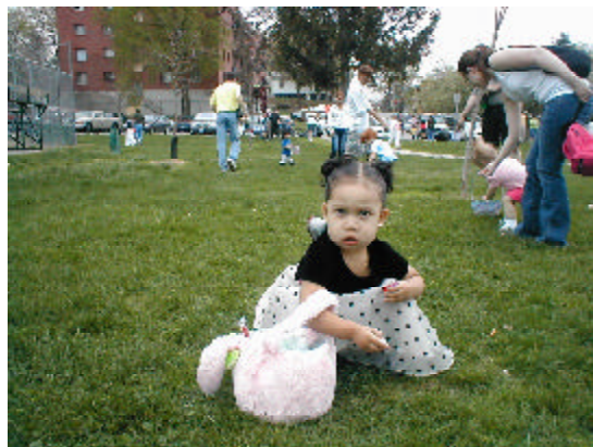
As you can see from this picture, Easter egg hunting is serious business.