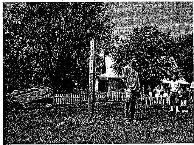
Left: A view of the Gifford Park Community Garden on a warm summer's day. Some of the "crops" that neighbors have planted include corn, tomatoes, okra, beans, peas, peppers, pumpkins, and squash Right: Community Gardener Eric Noll talks about the significance of the Peace Pole during the dedication ceremony on July 26.