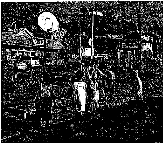
Top left: the 3-on-3 street basketball tournament was once again a popular event.